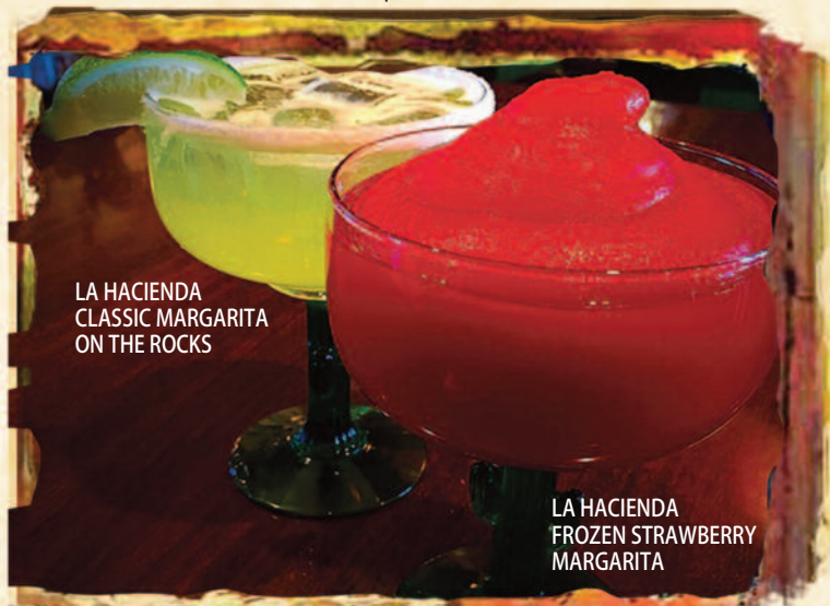
LA HACIENDA CLASSIC MARGARITA ON THE ROCKS