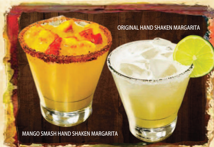
MANGO SMASH HAND SHAKEN MARGARITA

Tanteo Jalapeno Tequila, Cointreau Orange Liqueur, agave nectar and fresh lime juice. Spicy! Served in a rocks glass. 15