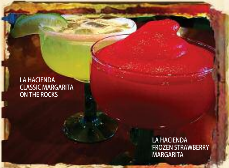
LA HACIENDA CLASSIC MARGARITA ON THE ROCKS