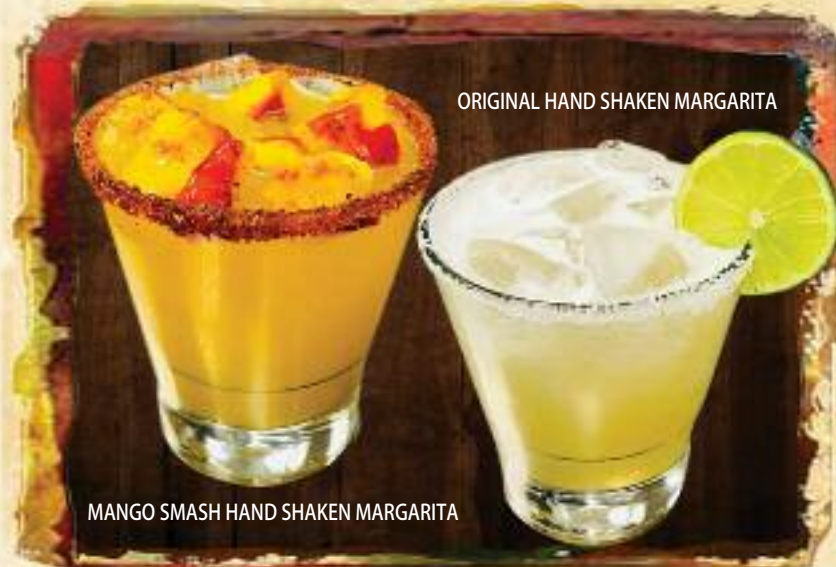
ORIGINAL HAND SHAKEN MARGARITA

Tanteo Jalapeno Tequila, Cointreau Orange Liqueur, agave nectar and fresh squeezed lime juice. Spicy! Served in a rocks glass. 12