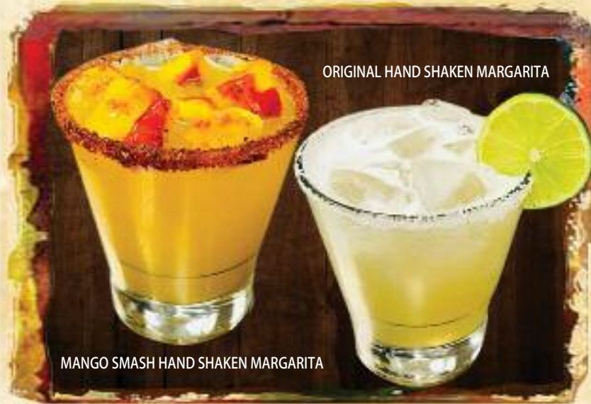
ORIGINAL HAND SHAKEN MARGARITA

Tanteo Jalapeno Tequila, Cointreau Orange Liqueur, agave nectar and fresh squeezed lime juice. Spicy! Served in a rocks glass. 12