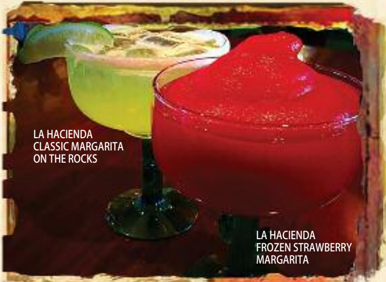
LA HACIENDA CLASSIC MARGARITA ON THE ROCKS