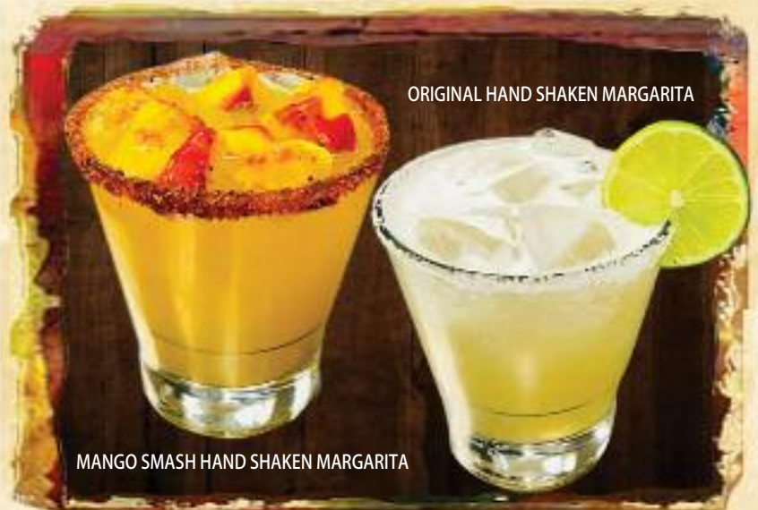
ORIGINAL HAND SHAKEN MARGARITA

Tanteo Jalapeno Tequila, Cointreau Orange Liqueur, agave nectar and fresh squeezed lime juice. Spicy! Served in a rocks glass. 14