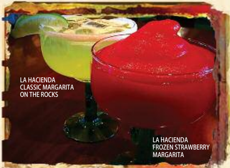
LA HACIENDA CLASSIC MARGARITA ON THE ROCKS